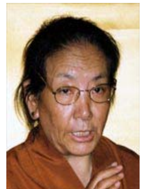
Her Eminence Jetsun Kushok

Enigma, 100 Old Christchurch Road, BH1 1LR 01202-316454 £30 DEPOSIT REQUIRED (Total cost £90) Balance due by July 1st